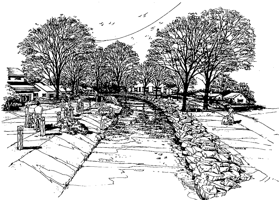
West Branch between Milwaukee St. & E. Washington Ave.