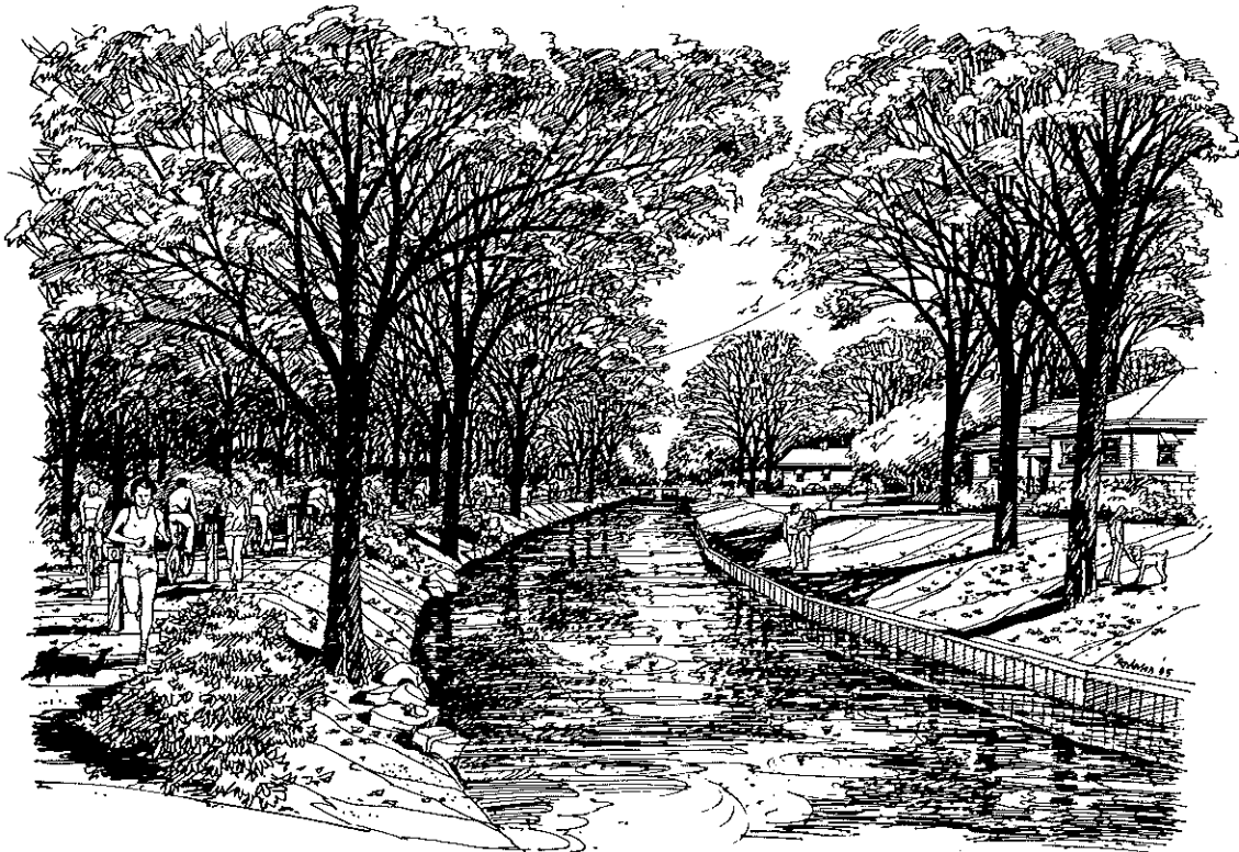
West Branch between Fair Oaks Ave. & Milwaukee St.